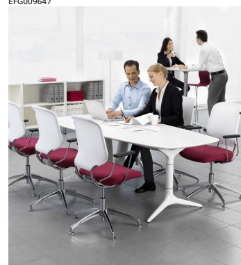
Table, height 720 mm