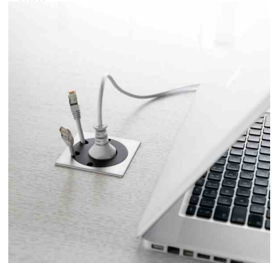
Configuration for 80 mm diameter cable hole