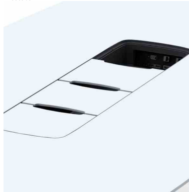
Connection box interior