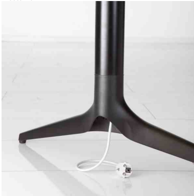
Cables are fed through the legs of the frame