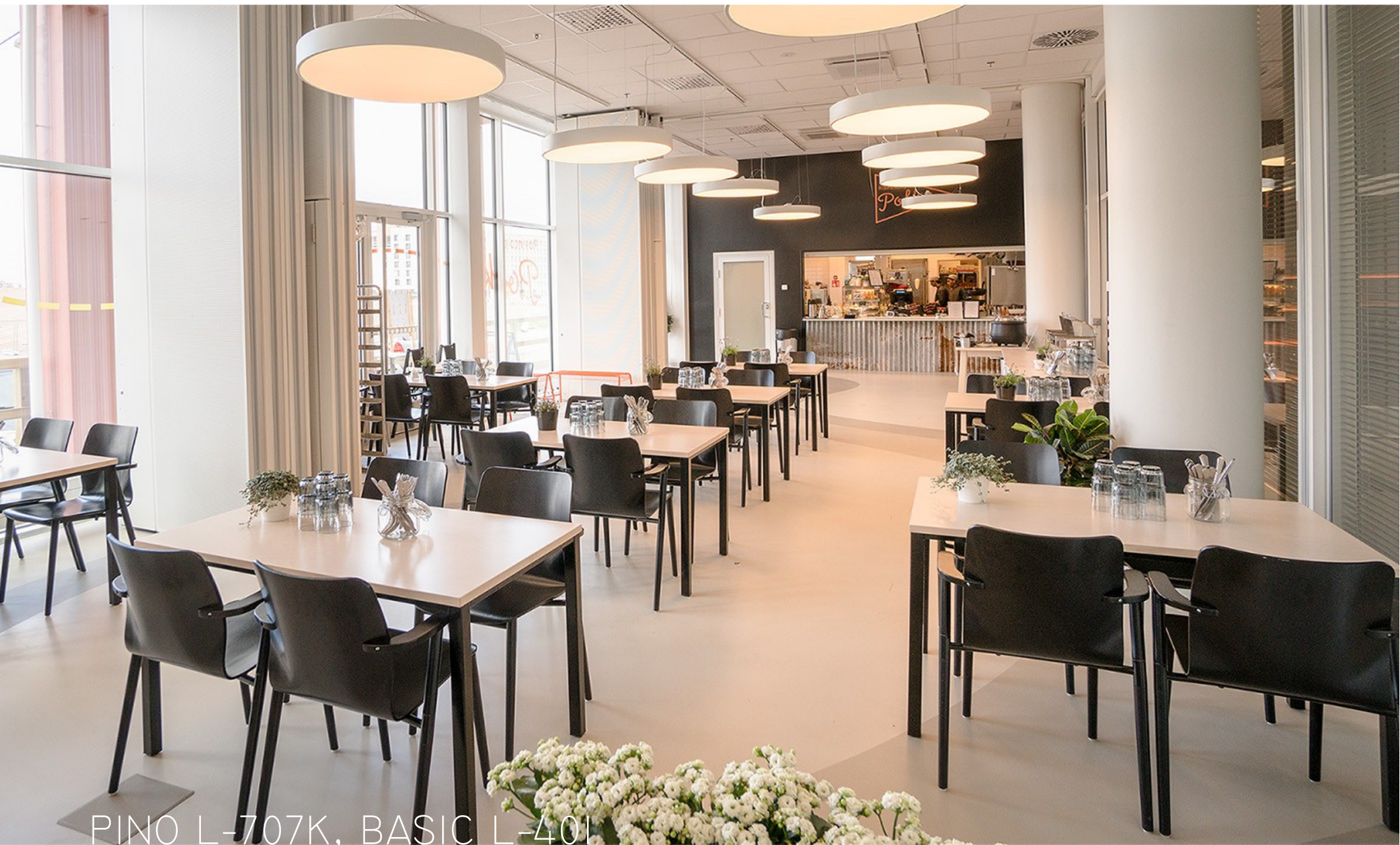
PINO L-707K, BASIC L-401