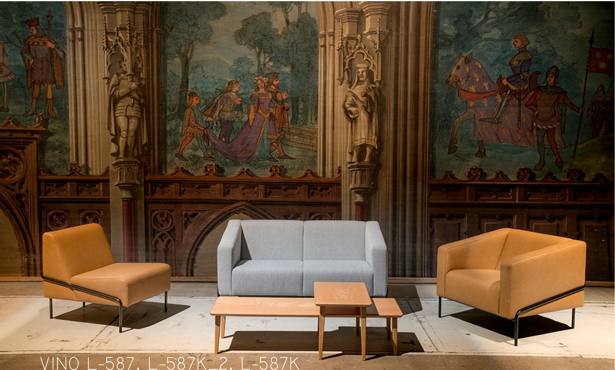
VINO L-587, L-587K_2, L-587K