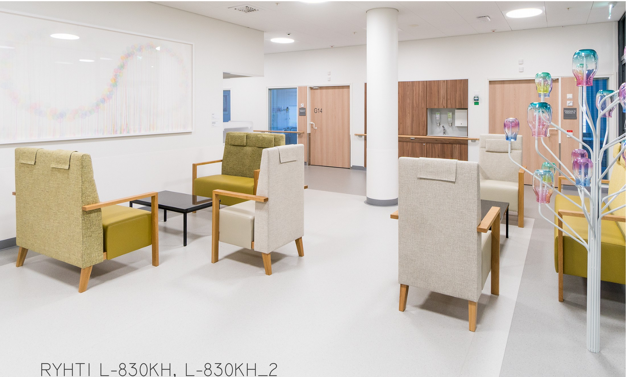
RYHTI L-830KH, L-830KH_2