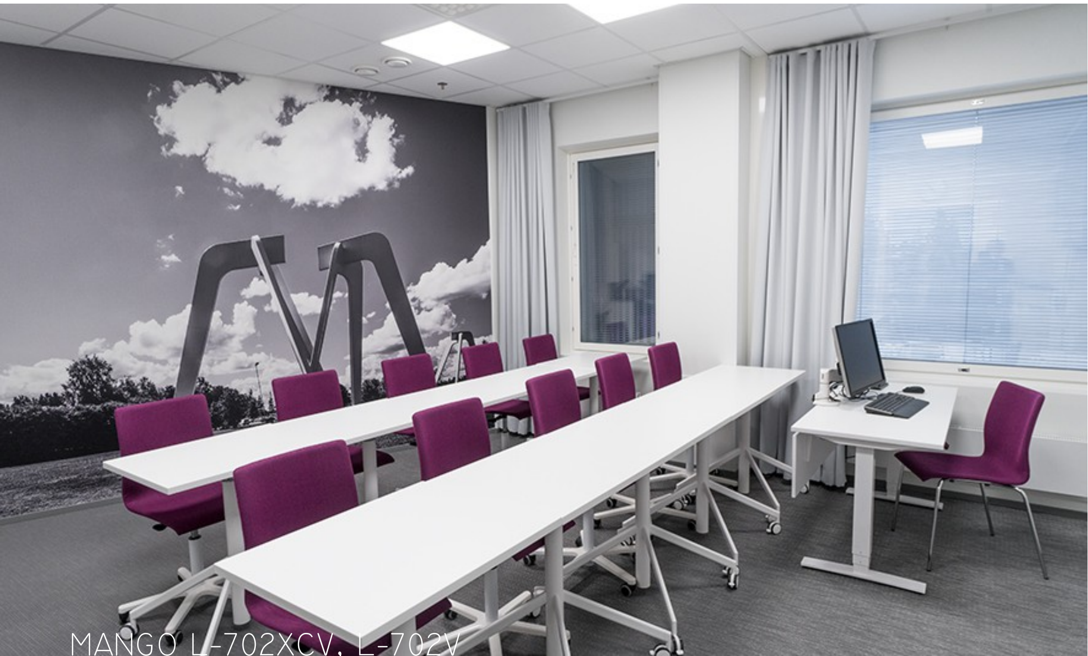
MANGO L-702XCV, L-702V