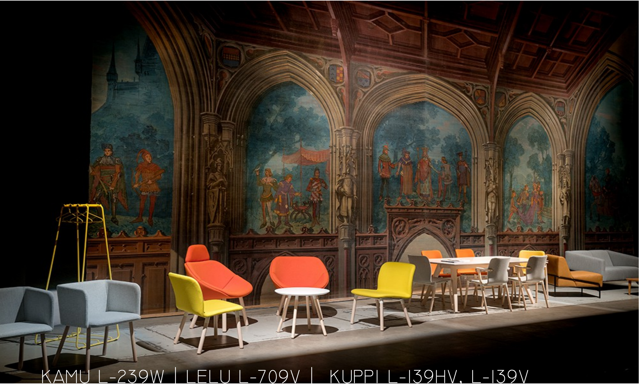
KAMU L-239W | LELU L-709V | KUPPI L-139HV, L-139V