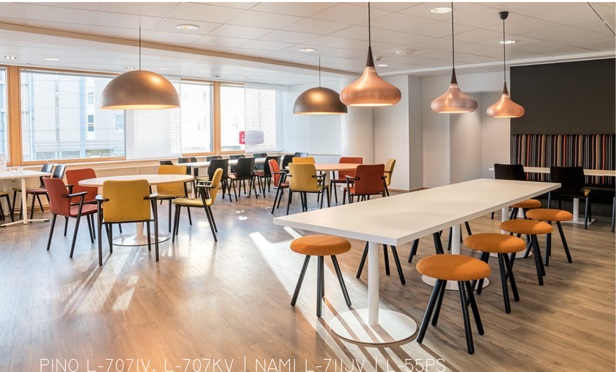
PINO L-707IV, L-707KV | NAMI L-711JV | L-55PS