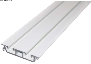
Toolbar, available in white or silver