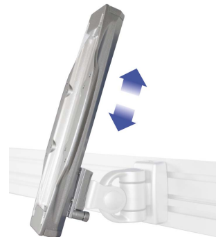
A29H28, silver. (A29H18, white). Slider for the arm (A29H13, white), (A29H23, silver), accessories toolbar