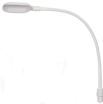
A29H17, white. (A29H30, grey) Lamp, accessories toolbar