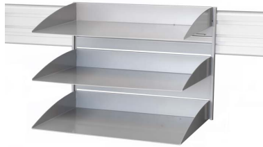
A29H25, silver. (A29H15, white). Sorting tray 3xC4, accessories toolbar