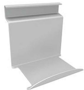
A29H33, silver. (A29H34, White). Headset-holder, accessories toolbar