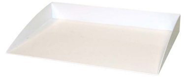
A29H11, white. (A29H21, silver). Shelf C4, accessories toolbar