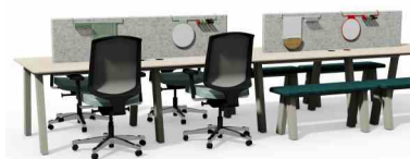
EFG Tab with EFG Add accessories