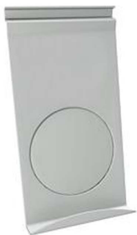
A29H36, silver. (A29H35, White). Smartphone-holder, accessories toolbar