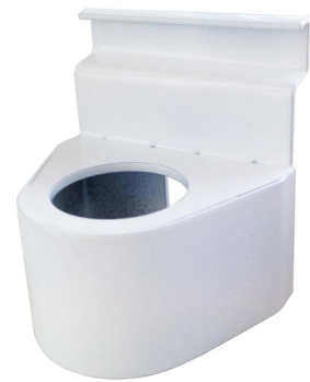
A29H16, white. Lamp bracket, accessories toolbar