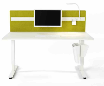
EFG Tab with toolbar