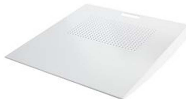
A29H32, White (A29H31, silver). LapTop-shelf, accessories toolbar