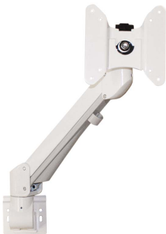
A29H14, white. (A29H24, silver). Arm for flatscreens, accessories toolbar