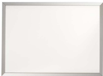
A29H12. Whiteboard, accessories toolbar