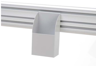
A29H20, silver. (A29H10, white). Pen holder, accessories toolbar